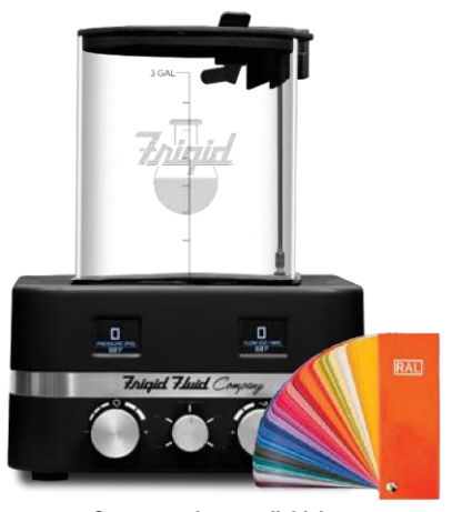
Custom colors available!